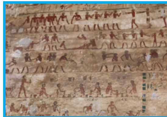
Art inside a tomb at Beni Hassan.