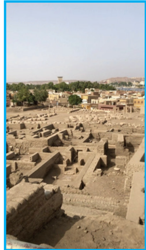
Deir el-Medina – the worker's village, with the remains of the homes of those who built the tombs in the Valley of the Kings.