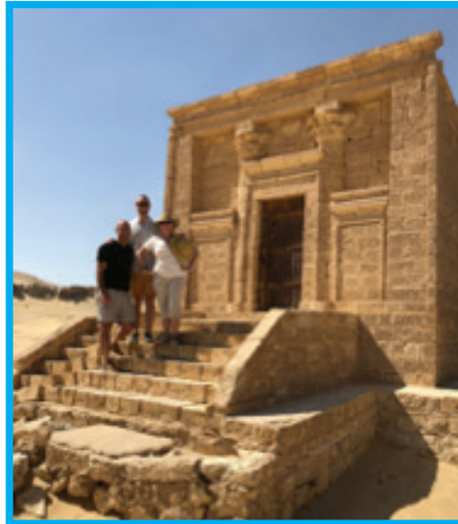
At Tuna el-Gebel, near the tomb of Isadora's mummy.