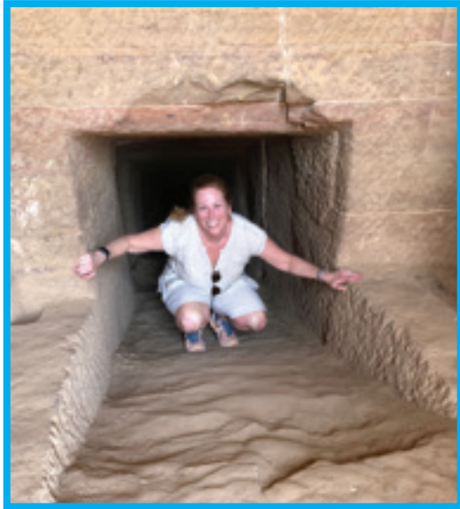
Crawling out of a tomb in Egypt.