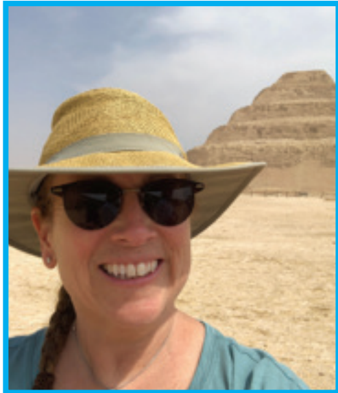
At Saqqara, Djoser's step pyramid.