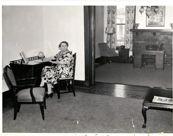
Georgia Tann posing in the reception parlor of the Poplar Street Mansion that served as her main orphanage and the headquarters for her child brokering business.

A TCHS ward offered as "Yours for the Asking!" in the Memphis paper. Such ads became so commonplace that some citizens of Memphis looked forward to the photos of the cute orphans with catchy titles and stories.