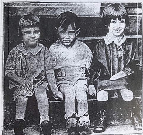
They'd Like to Be Your Christmas Gift